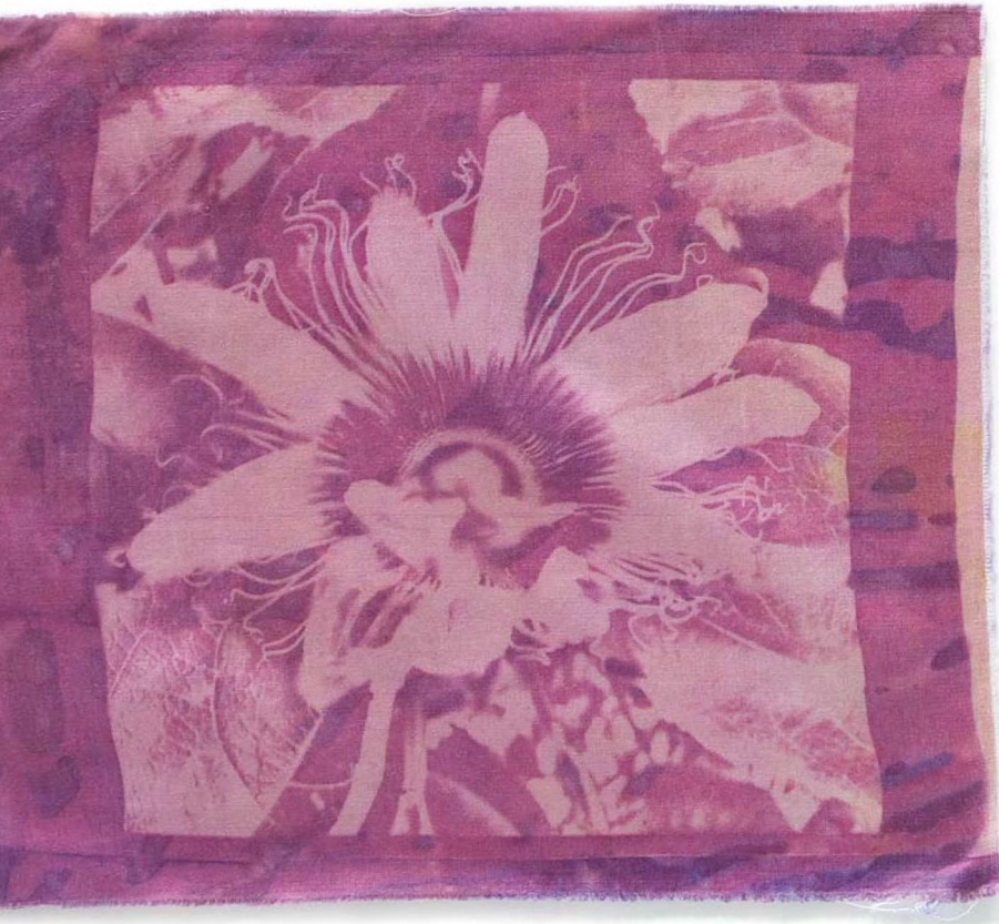
This image of a lilikoi flower was made from a photo and dyed onto fabric using SolarFast.

I love to experiment with different dyes and the effects that can be achieved. As soon as I discover a new product or dye process, I'm quick to try it. SolarFast from Jacquard is a product that is activated by exposure to the sun. The quick development time for this dye (10–24 minutes) encourages experimentation and I find I can play with several methods in one day. The technique that excited me the most was printing photo negatives onto fabric. I also experimented with shadow printing and resist dyeing. You, too, can take advantage of the next sunny day to create new fabric.